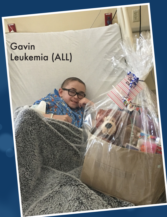
Gavin Leukemia (ALL)